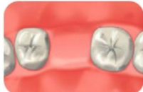
No Bone Loss