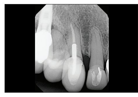
Figure 1. Preoperative radiograph of a nonrestorable maxillary right canine, requiring extraction. This tooth previously had root canal therapy and a post and crown.

Dental Solutions). The Physics Forceps design and associated technique eliminates not only the physical difficulty of removing teeth throughout the mouth; it also makes the process much easier and positive for the patient. The biomechanical design of the instrument reduces stresses placed on fragile root structure, helping maintain the facial plate of bone. When interseptal bone and the facial plate are maintained, the entire process of grafting and placing an immediate dental implant becomes more predictable.