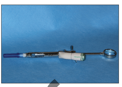
Figure 3. VibraJect (Golden Dental Solutions) was used to distract the patient and make an injection more comfortable.

release or "pop" out of the socket in an upward and outward motion, mirroring the arch form of the head of the instrument. This innovative instrument allows tooth dislodgment with little or no pressure, simply utilizing leverage. The handles are never squeezed like a conventional forcep; rather they are held lightly in the hand, and the wrist is rotated to simply create tension on the palatal aspect of the root (Figure 4). There is no forearm, bicep, or shoulder pressure used. The handles simply allow the beak to engage the root structure without slipping off.